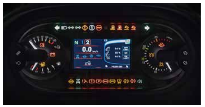
Completely new dashboard with color display improves clarity and awareness of information given to the driver. All important data are placed in one place.

To control the tractor is easy and very intuitive. All controls are always at hand.