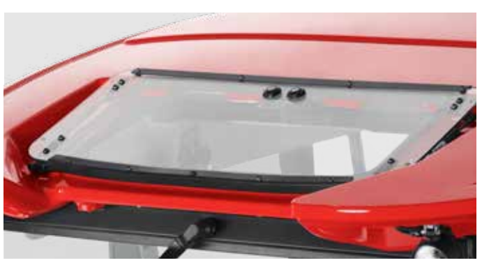
The roof window ensures the good visibility during the work with a front loader.